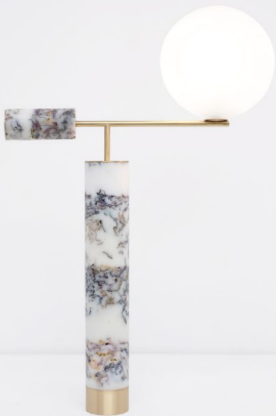
A LAMP BY MARCIN RUSAK. COURTESY