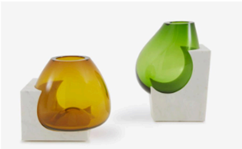
Hand-blown, biomorphic glass forms are fused seamlessly into marble bases. Pictured: a pair of vases from his 'Osmosi' series.