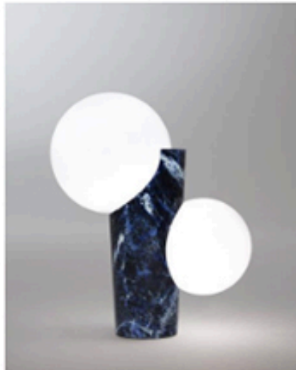
Babel tapped into centuries-old Italian craftsmanship while also turning to computerised technology to complete the distinctive body of work. Pictured: a coffee table (pictured left) and a table lamp (right)